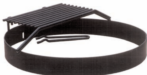
Fire Ring Grill

This is where memories are made, Huge 63" Octagon fire ring is built for extra large groups, 322 sq. inch cooking grate with 12" Cooking height, and a handy pot hanger, both turns 360 degrees over the fire or out of the ring for easy access. The ring is built from 3/16" thick steel plate 8" high. The cooking grate is made of 1/4" thick round steel bars, supported by 5/8" thick steel. Octagon Shape makes this fire ring very attractive and durable. By selling fire wood & food the fire ring pays for its self. Pot not included. $329.00