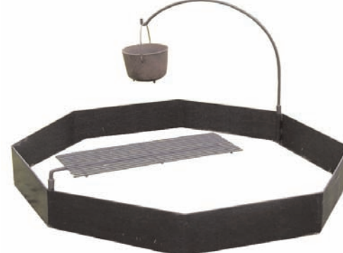
Octagon Fire Ring

Hold in heat & smoke. Covers also keep rain out of firebox to prolong life of grill. provides 360 sq. inches of cooking area, Grill is hinged to flip up for easy fire building & clean out. Measures 12-1/2" x 30-1/2" x 6-1/4". Sits on two 1-3/8" OD x 42" long post. Cover is 16 ga. steel with 1/4 steel stay cool handle, bottom is 3/16 thick Steel, grill is made of 1/4" dia. steel bars, only 1/2" apart, Unit is finished with high temp non-toxic black enamel paint. Model G-C30 61 lbs. $347.00 Without Cover $219.00