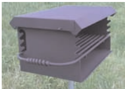
Adjustable Covered Grill

Cover helps hold in heat & Smoke, keeps rain out so you can keep cooking, also prolongs life of grill. Cover is made of 16 ga. thick steel with 1/4" handles for easy lifting. 14" x 20" grill adjusts to four different cooking heights. Stay cool handles allow adjustments while cooking. Grill connects to post with hex head set screw to prevent wobble & deters theft. Ash retainer across front, draft & drainage front & rear. 10" high sides made of 10 ga. thick steel. Bottom is 3/16" thick, 1/2" solid steel bars are only 5/8" apart. Grill flips back yet cannot be removed. Dipped in heat resistant non-toxic black paint. 42" extra long 1-3/8" O.D. thick schedule 40 pipe. 28" wide, 16" deep.